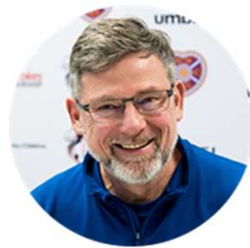
CRAIG LEVEIN DIRECTOR OF FOOTBALL